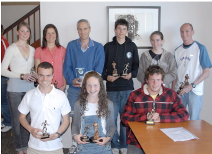
Geelong Award Winners proudly display their trophies at the Presentation Arvo.

Individually, well done to Lee Troop, who was the Athletics Victoria Senior Mens' Champion Athlete for 2007. (Note: an interview with Lee appears later in the newsletter)